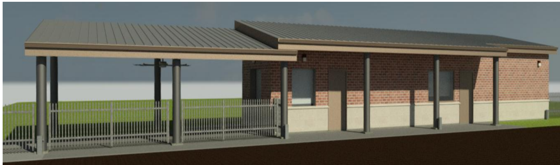
New Concession Stand and Field House to support our growing Athletics programs